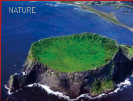
Jeju, UNESCO World Natural Heritage