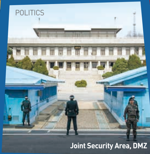
Joint Security Area, DMZ