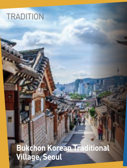
Bukchon Korean Traditional Village, Seoul